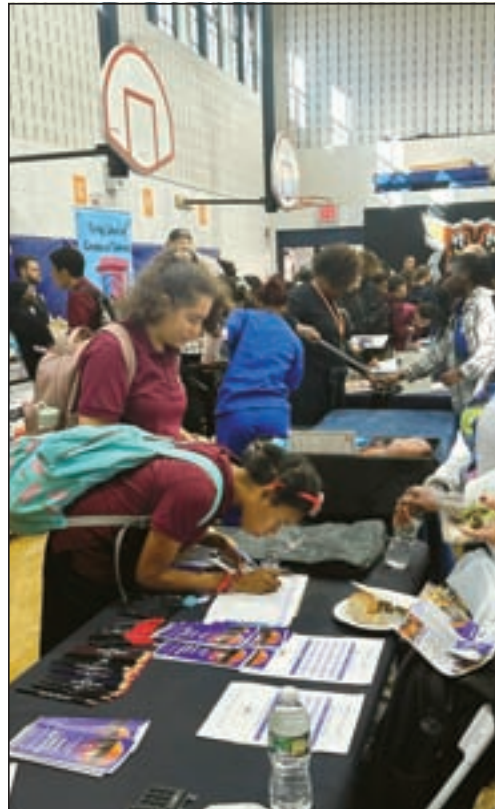
STUDENTS RECEIVE INFORMATION from Bronx Legacy High School at the High School Fair held at P.S. / M.S. 20 at 3050 Webster Avenue in Norwood on Friday, Nov. 8, 2024.