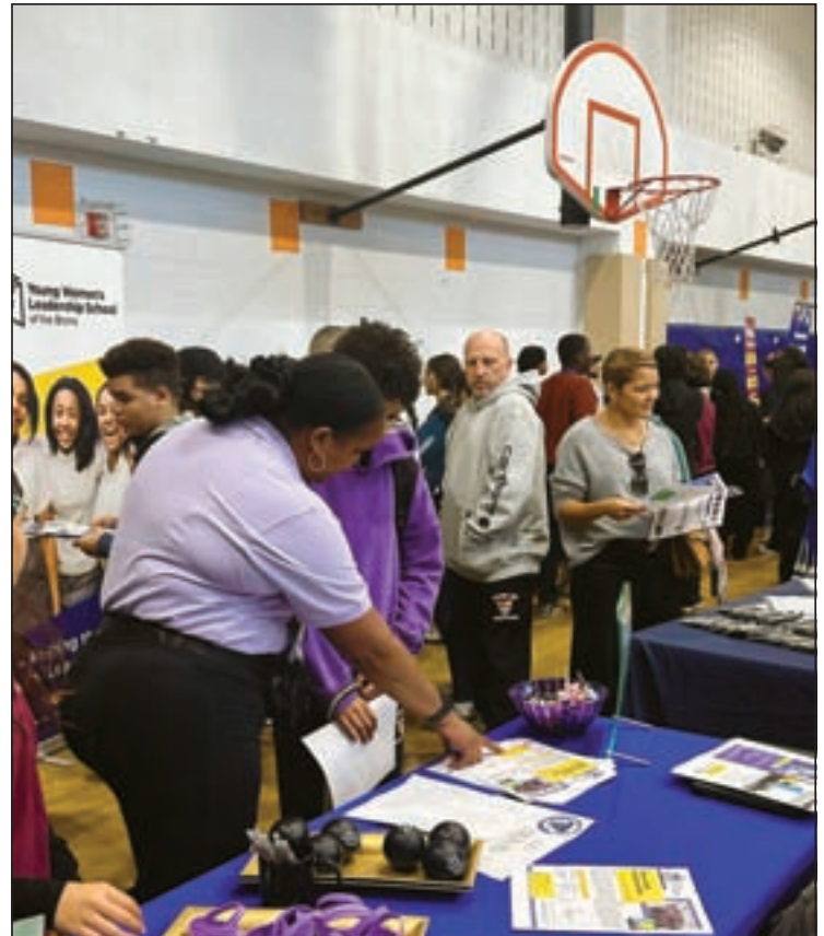
STUDENTS RECEIVE INFORMATION from Validus Preparatory Academy at the High School Fair held at P.S. / M.S. 20 at 3050 Webster Avenue in Norwood on Friday, Nov. 8, 2024