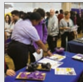
High School Fair held at P.S. / M.S. 20 pg 2

NWBCCC "unites diverse peoples and institutions to (continued on page 15)